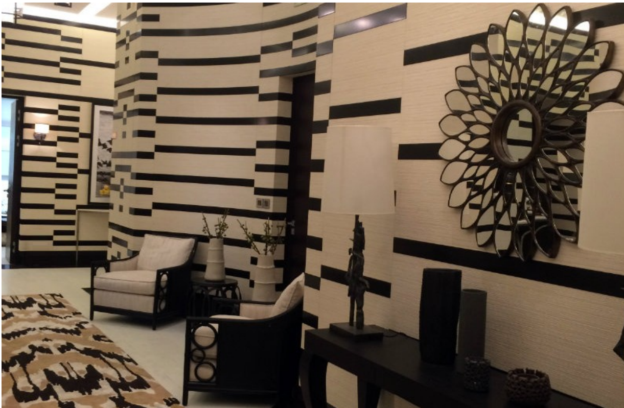
Private villa project by Dragan Architecture