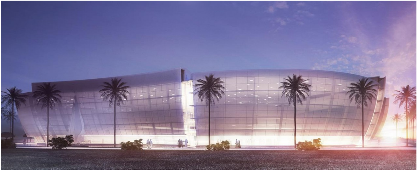
Transports Museum project in Doha, Qatar by Dragan Architecture

“What I am trying to do with my work is to always have a concept behind and a true idea behind the concept.”