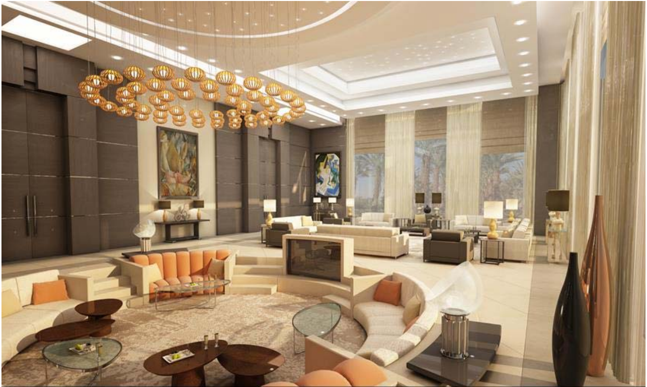
Boutique Hotel lobby and salon

Right now we have an architecture and interior design hospitality project close to Saudi Arabia (in the East Coast). Also, we are making some houses in France and two villas near Paris. In China, we are engaged in a project of a classical villa.