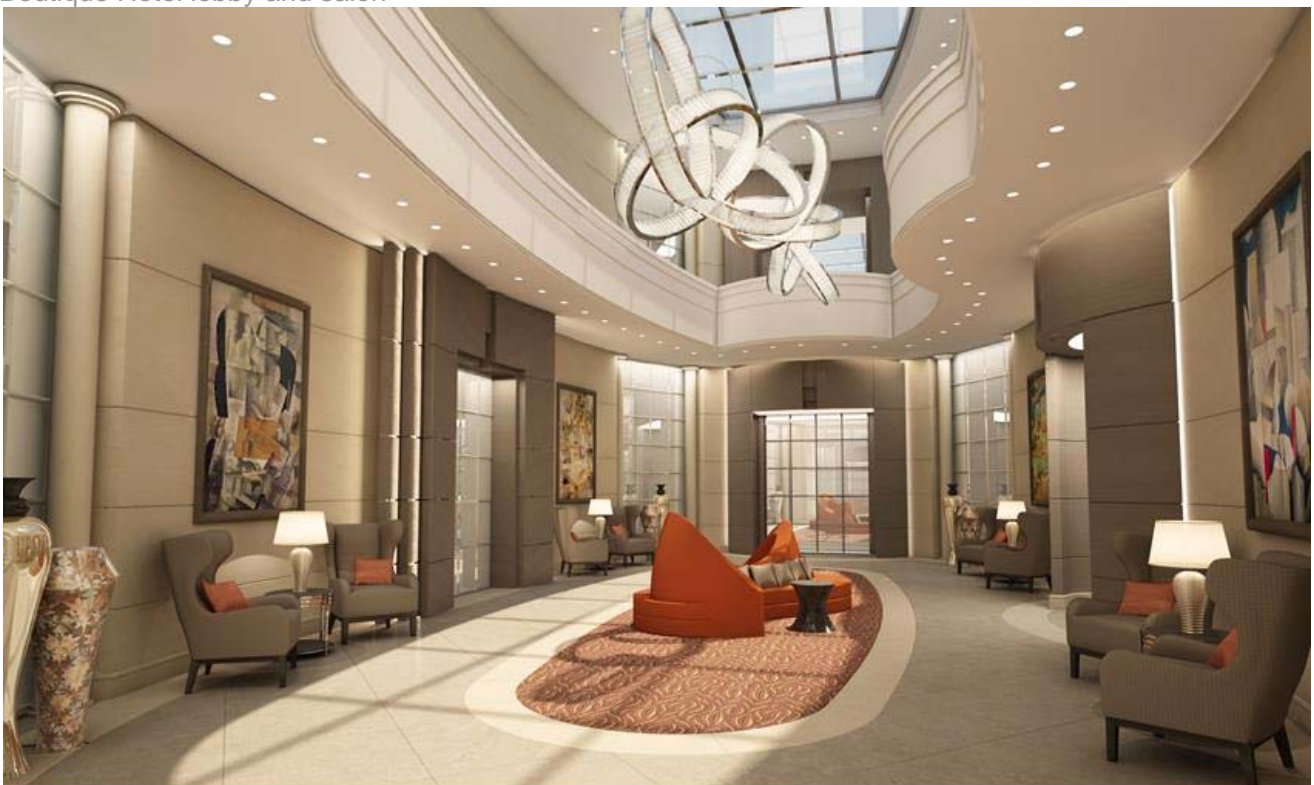
Boutique Hotel lobby and salon